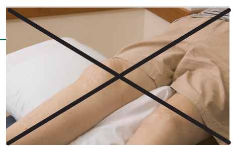
3) Do not place pillow under your knee.